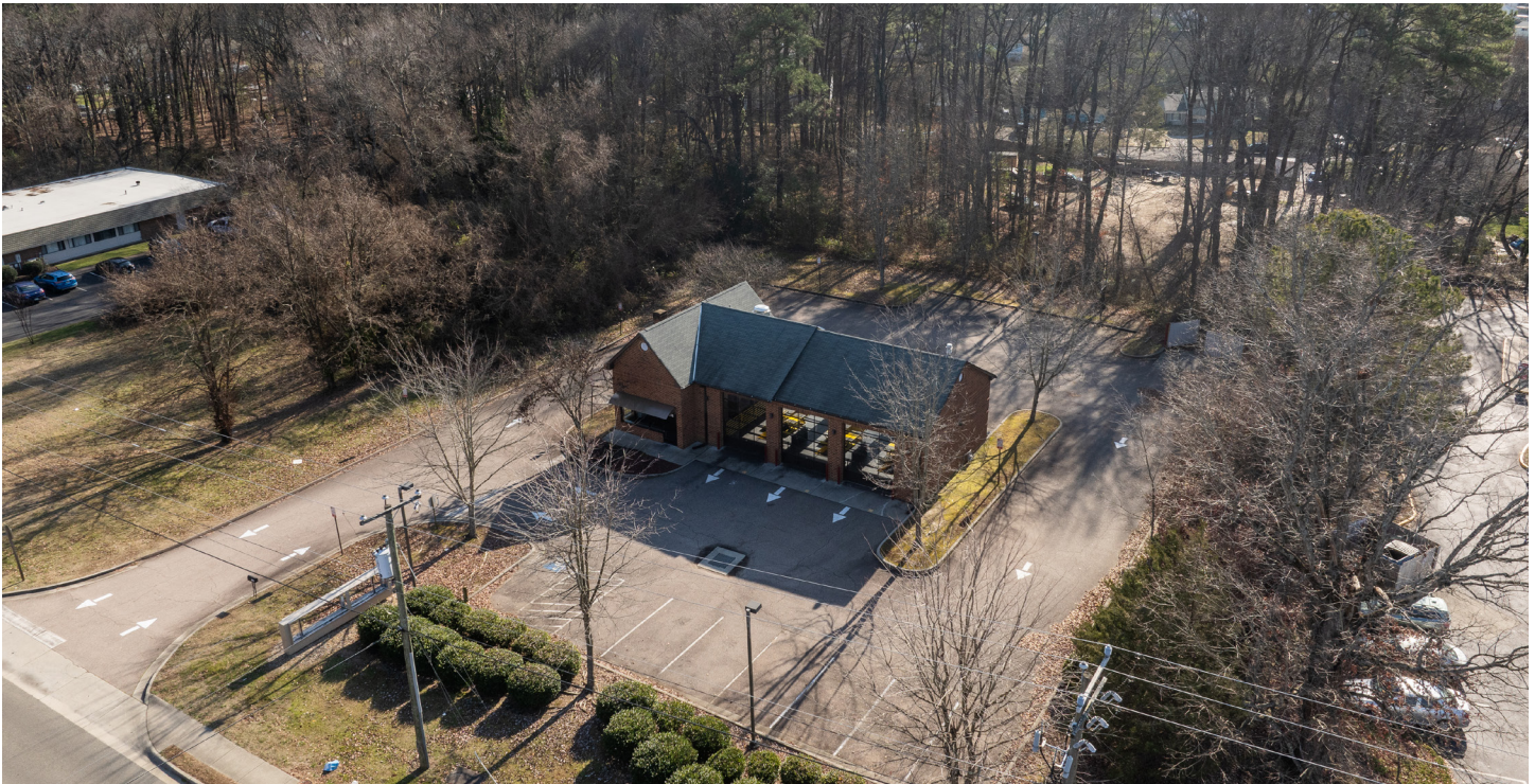
Front Elevation (Exit)