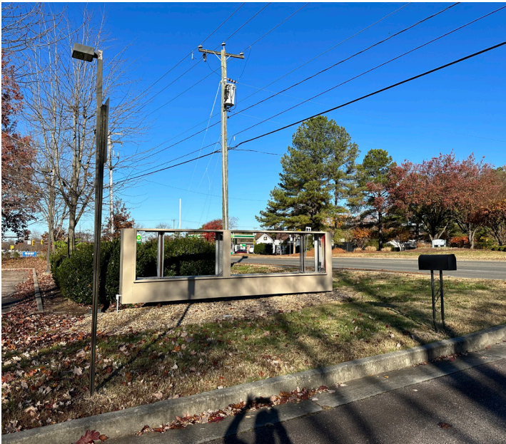
Large Monument Sign