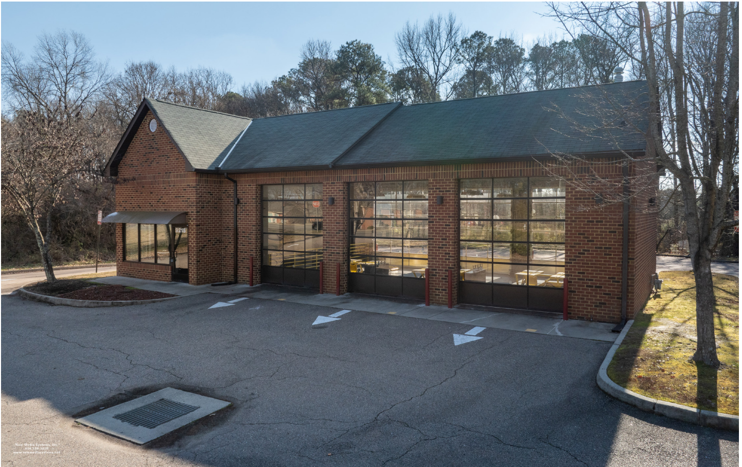
Front Elevation (East)