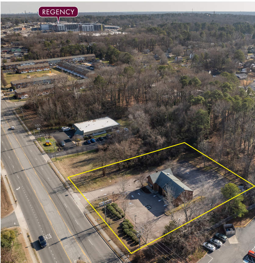
1 mile from the Regency retail hub