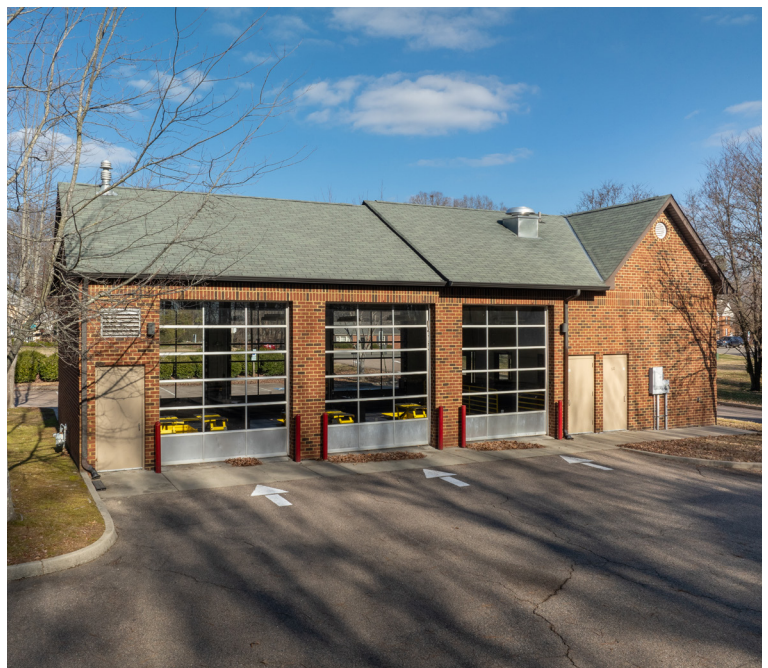
Rear Elevation (Entry)