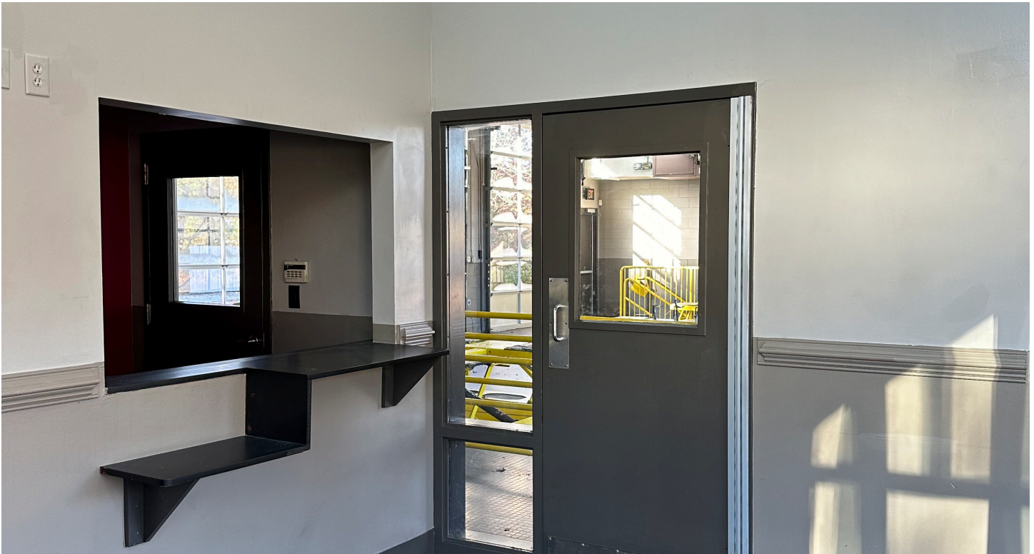
Office and Waiting Area