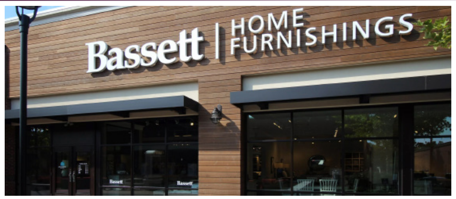
THE MARKETPLACE AT TECH CENTER 12090 JEFFERSON AVENUE | NEWPORT NEWS, VA 23606