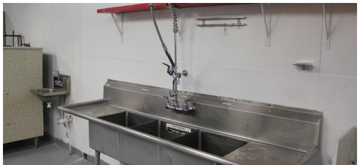
3 COMPARTMENT SINK