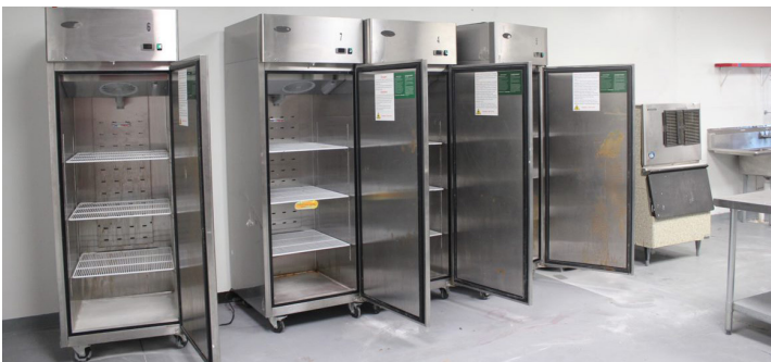
SEVERAL REFRIGERATION/FREEZER UNITS & ICEMAKER