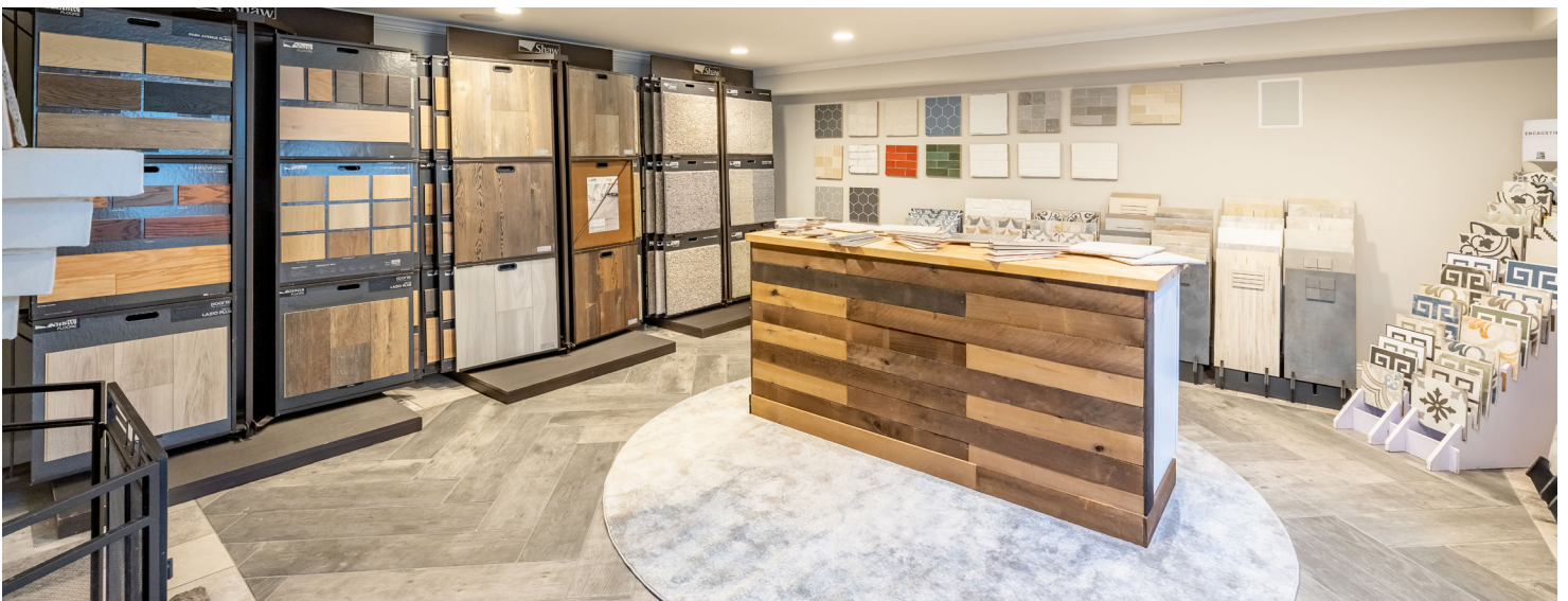
Basement | Showroom