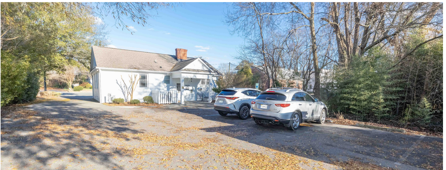
Rear Entrance and Parking | Handicap Access