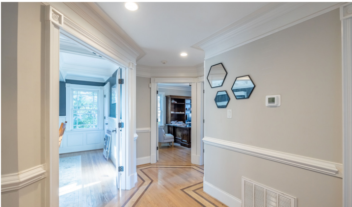
Hallway connecting Offices & 2nd Floor