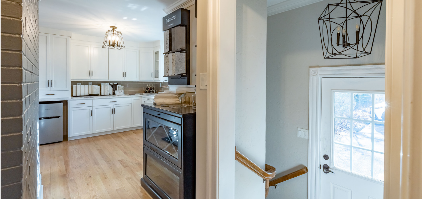
Backdoor leading to Basement & 1st Floor