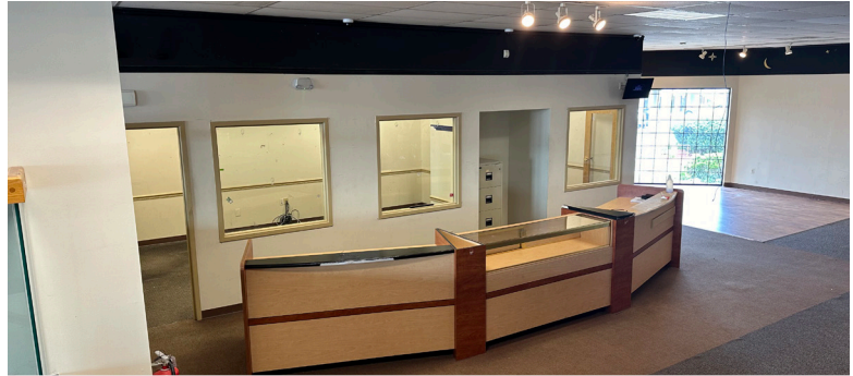
Private Offices and Sales Counter