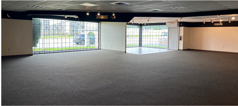
Interior with Large Storefront Windows