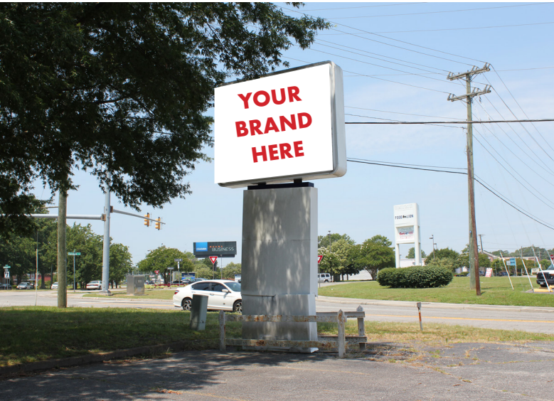
Highly visible pylon signage