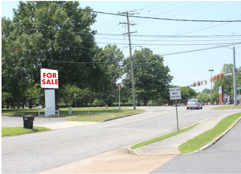
Corner parcel located at signalized intersection