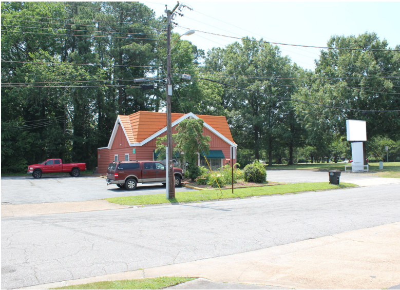
Two ingress/egress points for adding a drive-thru