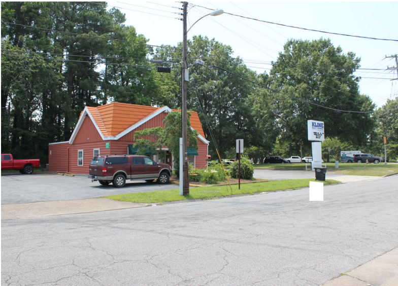
Ample and convenient parking on both sides of building