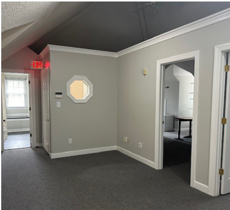
Entrance | Private Restroom | Reception