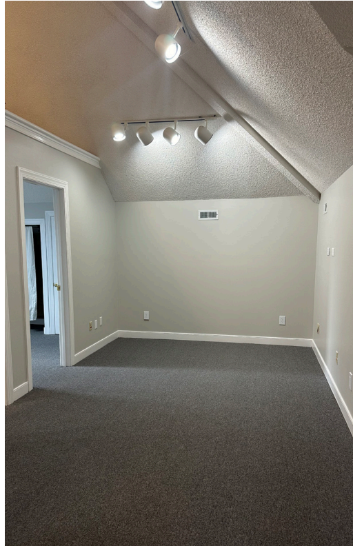
Reception | Waiting Room