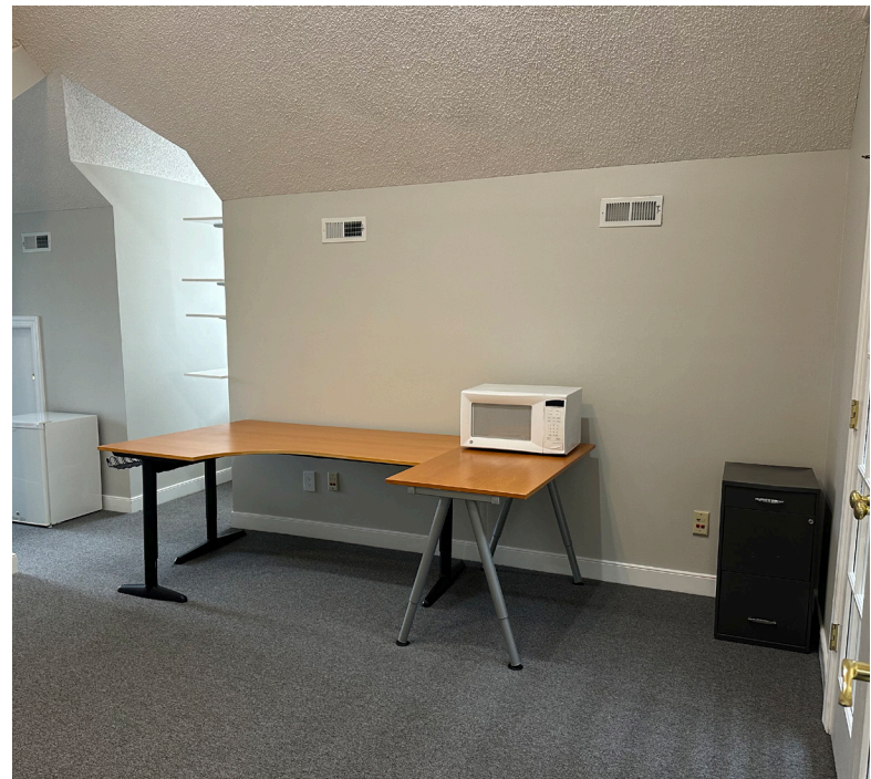
Office | Workroom With Vaulted Ceiling

4135 Ironbound Road, Williamsburg, VA 23188 | janetmooreccim.com | 757.645.4500