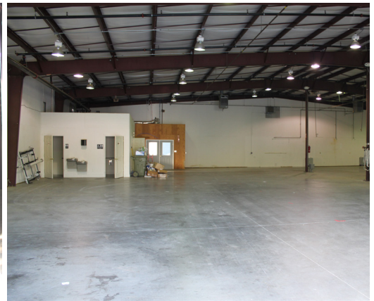
Two (2) Restrooms in Warehouse