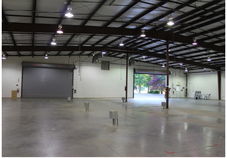
Grade & Dock Level Loading Doors at front of space