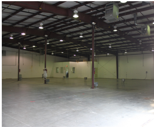
Warehouse | 17' Clear