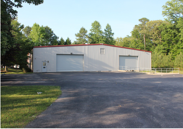
Front Entrance and Parking