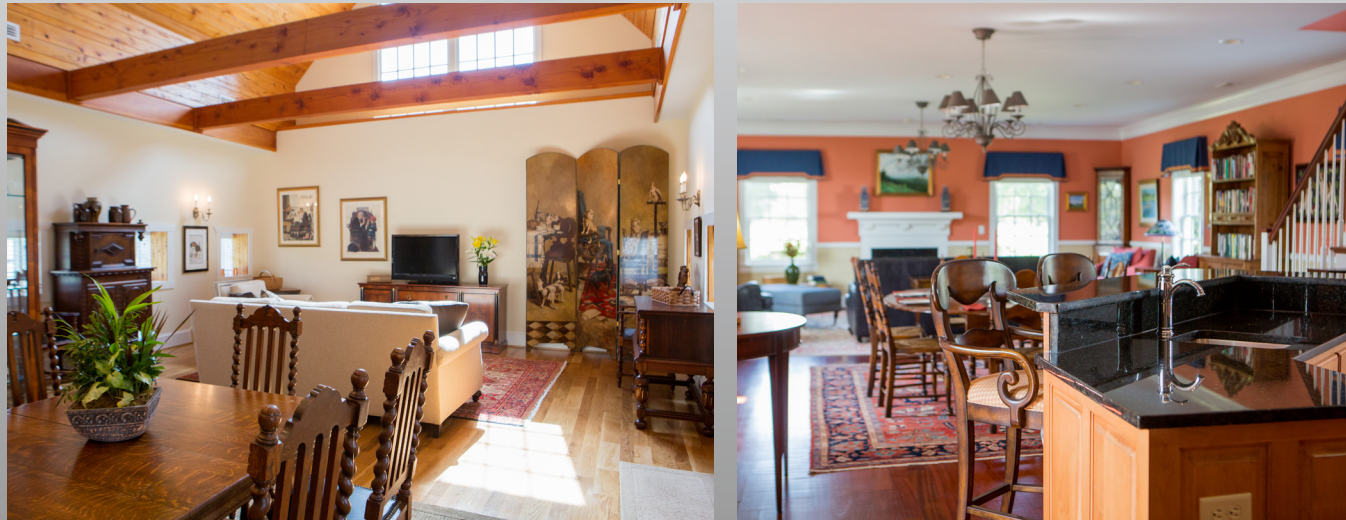
The former stables have been converted into a 3,800 square foot Carriage House featuring open living spaces with two kitchens, 3 bedrooms and 3 full baths.