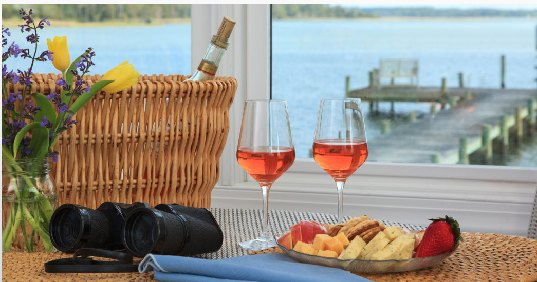
Just a short distance from the Manor House, enjoy fishing and crabbing from the pier complete with boat lift. Gather around the firepit and take in beautiful sunsets on the Severn River.