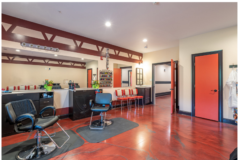
Barber | Beauty Salon