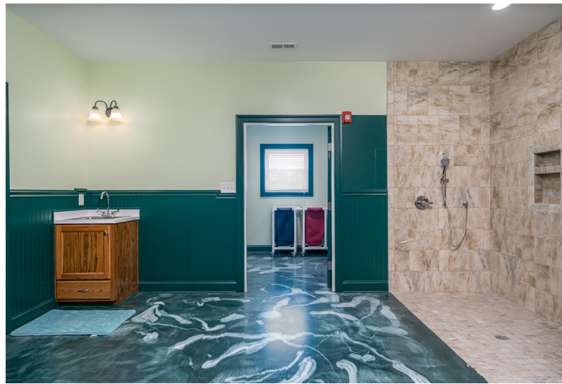
Wheelchair Accessible Shower