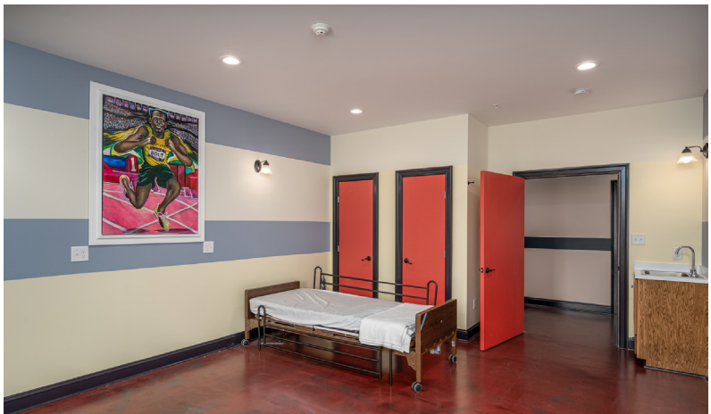
Bedroom | Exam Room with Sink