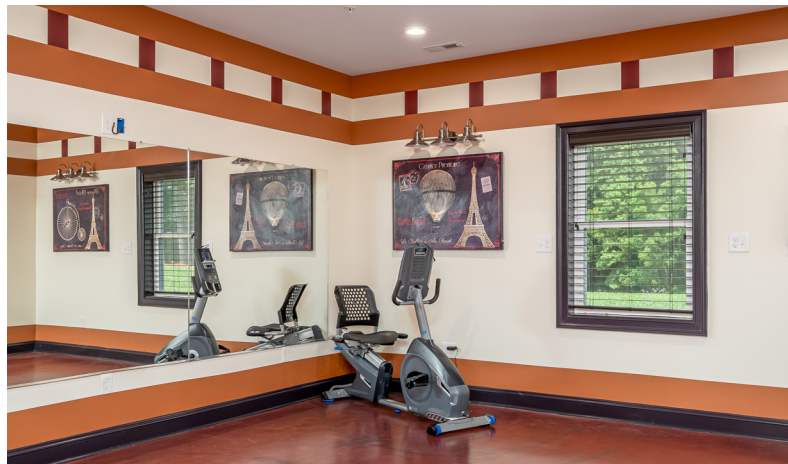
Exercise | Dance Studio