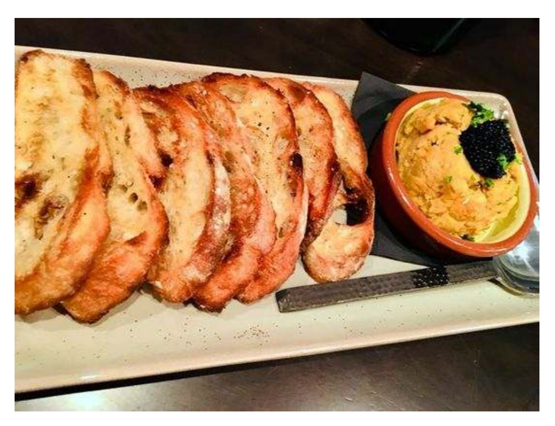
Harissa with salt cod, lemon, roe and toast at The Cave Bistro & Wine Bar in the Galleria Shoppes at Vanderbilt in North Naples.

Cold plates range from harissa ($8) with salt cod, lemon, roe and toast to a charcuterie ($16). Choices also include mango radicchio salad ($13) with prosciutto, toasted seeds, lemon and basil; and tuna crudo ($14) with sesame sponge, coffee kabayaki, ginger and radish.