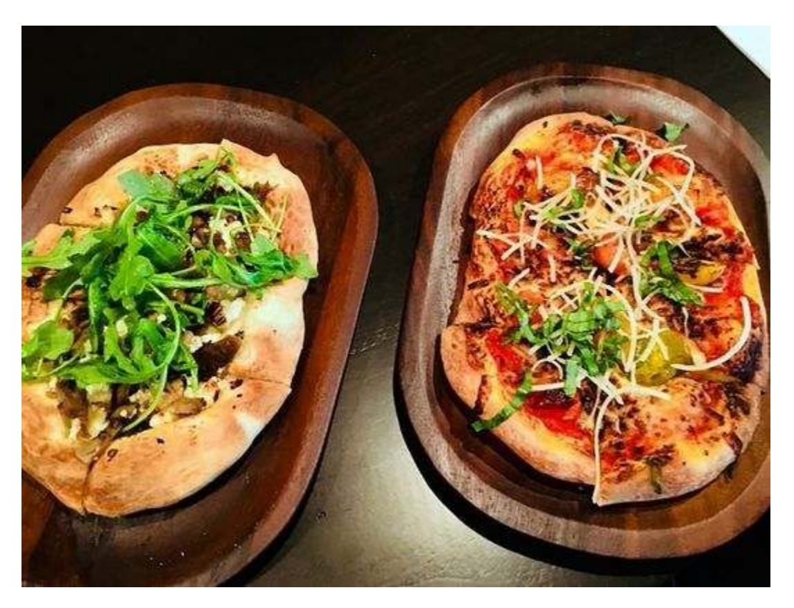
Flatbread selections at The Cave Bistro & Wine Bar include duck confit and goat cheese, left, and roasted heirloom tomato.

"I don't have one dish over $20," Hampton said. "I think I have a cheese and meat platter which is $24. Everything else is under $20. So, it's reasonable."